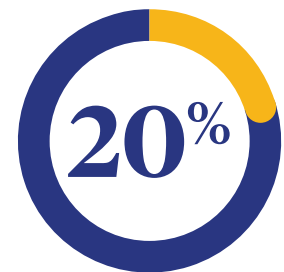
average retail gym membership savings with One Pass Select 3

Half of U.S. consumers report wellness as a top priority in their daily lives. 1 One Pass Select™ is designed to help make it easier for your employees to prioritize their health and wellness through a lower-cost, extensive nationwide gym network — including digital fitness. Best of all, your employees have the freedom to choose the option that fits their needs and lifestyle.