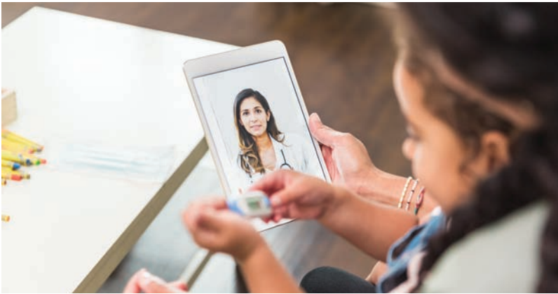
1200x627 image (lifestyle/stock image) JPG