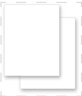
400x466 thumbnail (2 pages) PNG