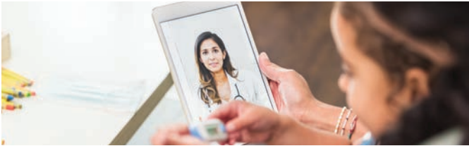
1000x300 image (lifestyle/stock image) JPG

Articles, case studies & study summaries